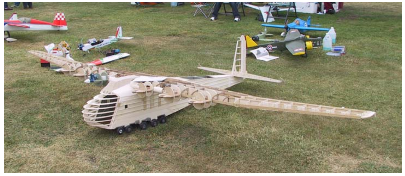
The Messerschmitt Me 323 is still under construction but is already showing a formidable presence.