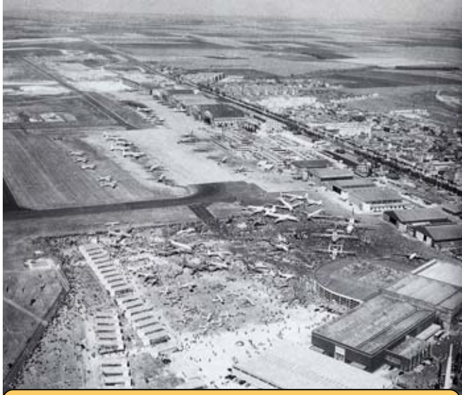
The 20th Salon International de l'Aeronautique held in 1953 saw its biggest move completed. The Grand Palais, as the site of the biennial show, was a thing of the past, as everything was shifted to Le Bourget Aeroport, where it would remain.