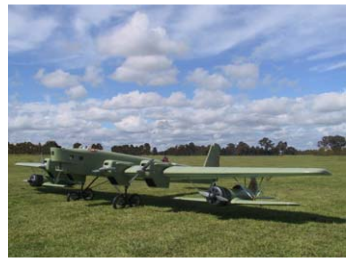
The Tupolev TB-3 powered by four 0.46 engines and with the electric Polikarpov I-16's under the wings.