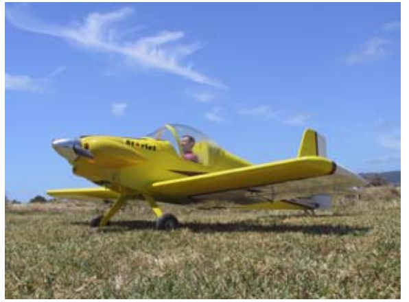
lan Lamont's ARF Corby Starlet has a OS 70 4 stroke motor. The model flies very well but still had the usual ARF undercarriage weakness.