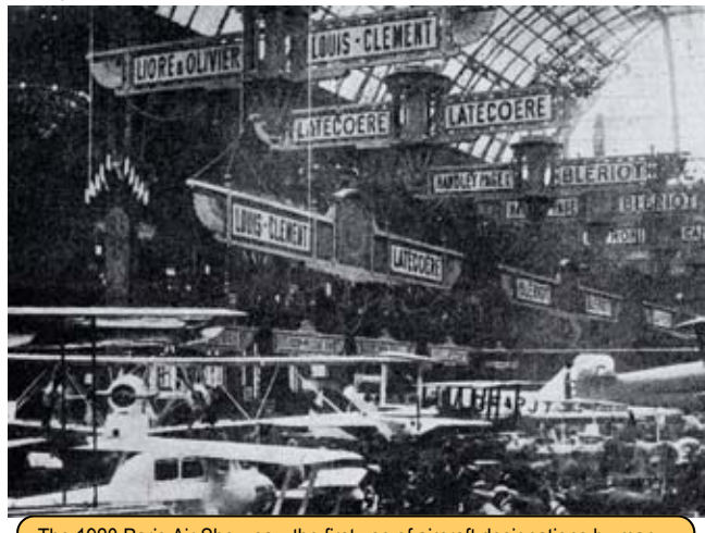
The 1920 Paris Air Show saw the first use of aircraft designations by manufacturers. Aircraft now had letters and numerals in their names to designate each model.

One of the more significant changes from prewar days was for manufacturers to give their aircraft designations: Caudron C-25, Farman F-60. With this came the first identifications for individual aircraft. In 1919, civilian aircraft first received national registrations: N for the United States, G for Great Britain, F for France etc. Both these innovations continue to the present day and are considered indispensable.