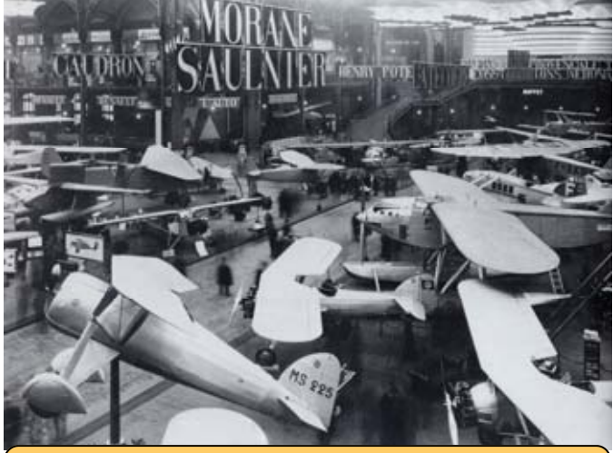
The 1932 Paris Air Show. The parasol monoplanes are from Morane-Saulnier, all with their characteristic swept wings. The larger monoplane at the right is the Late-core Lat.290, twin float seaplane.