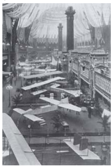
There was less greenery and more flying machines than in the past years. From the front: Caudron amphibian, Drzeweicki double monoplane, Zodiav triplane, Savary biplane. Note the lack of lighter than-air craft hanging from the rafters.

The fourth show in 1912 was not merely a technical exhibition. It was a way for France to show its own people how it was spending some of their tax money, and the rest of the world how it was using the latest technology for defence. The French turned out in great numbers and were suitably impressed.