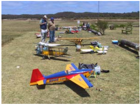
A few of the models in the pits.