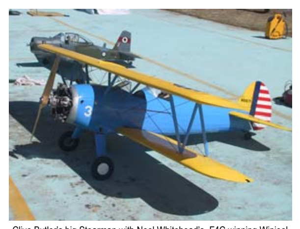
Clive Butler's big Stearman with Noel Whitehead's F4C winning Winjeel at the rear. Clive flew the Stearman in Large Scale on Sunday but was unlucky to suffer an engine failure during a "touch and go". The big model was damaged when it finally landed in the outfield but is repairable.