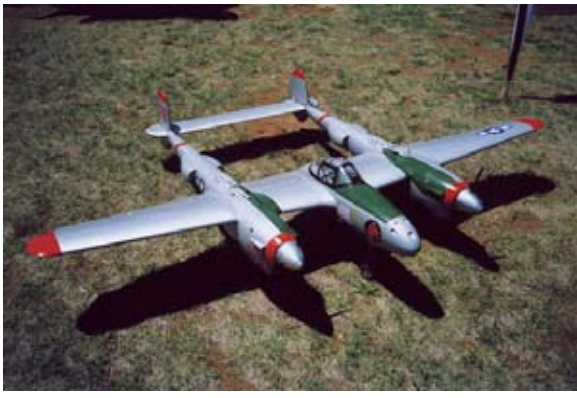
A nice ARF "Lightning" by Norm Lewers made many flights on the day.