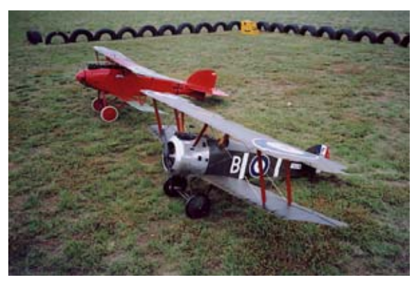
These two old timers flew around the circuit together at about the same speed. Andrew Smallridge's Camel is powered by a Laser 200 vee twin and weighs 6.5kg, compared with the Red Baron's Moki 180 powered Albatros at 9.5kg. The Camel proved agile enough to avoid the gunsights of its pursuer.