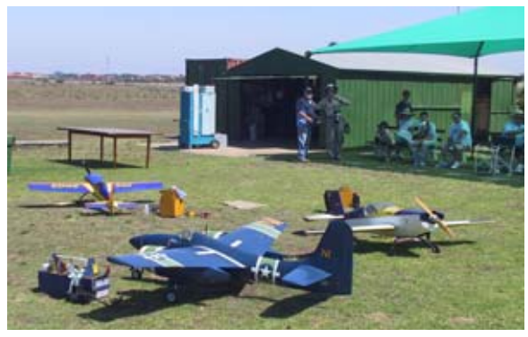
Some of the Keilor members' models with Rod Mitchell's second place Tigercat in the foreground.