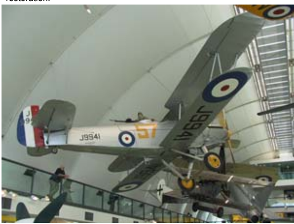
This Hawker Hart bomber was another creation of Sir Sidney Camm. Over 400 were built and many were flown by the RAF in the Middle East and in India between the wars.