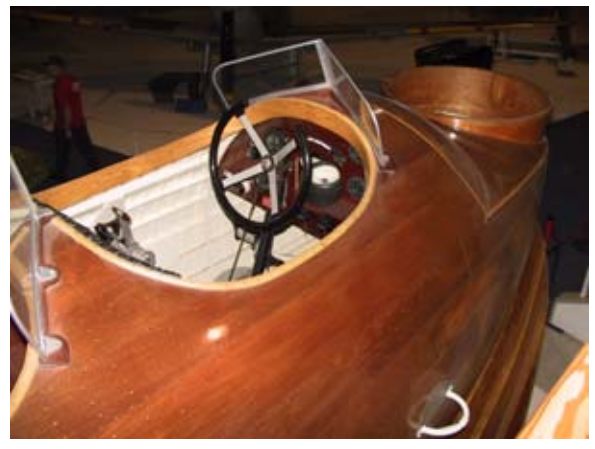
Beautifully restored woodwork on this Supermarine Southampton flying boat from the 1920's. More than 75,000 small screws were used in the restoration.