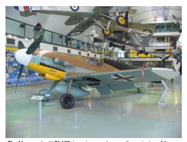
The Messerschmitt Bf-109, in various marks, was the mainstay of the Luftwaffe Fighter Command throughout WWII.

The Battle of Britain Hall tells the story of the world's first decisive air battle—when the Royal Air Force stood alone against the might of the German Luftwaffe.