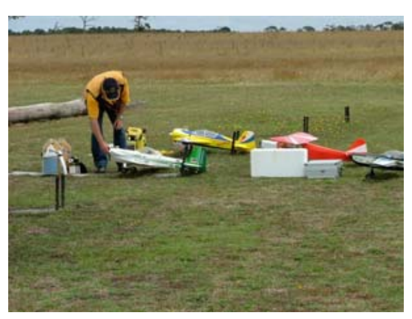
Some of the Geelong members models with Robert Lauder's Civil Flying winning Yak 54 in the background.