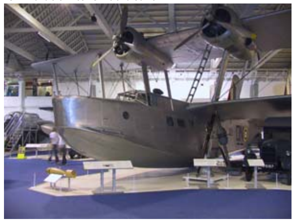
The Supermarine Stranraer flying boat \, was designed in 1936 but also saw service in WWII.