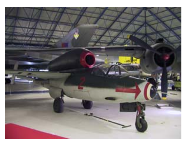
This Heinkel He 162 was an early jet fighter first flown in 1945.

The Milestone of Flight building was opened on December 17th 2003 — exactly 100 years after the first powered flight by Orville