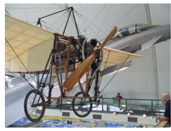
A Bleriot XI suspended from the ceiling in the Milestones of Flight exhibition.