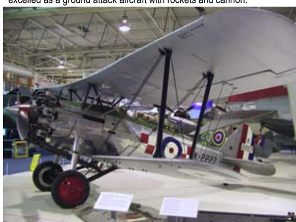
The Bristol Bulldog first flew in 1927 and operated with the RAF until 1937.