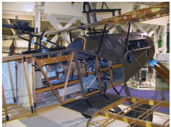
A Bristol Fighter with covering removed to show the construction.