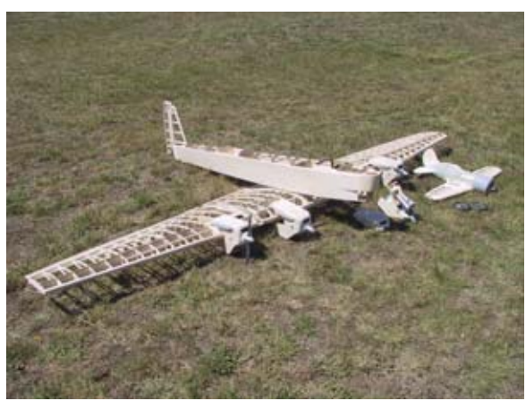
There was still a lot of work to be completed when Ken showed the model at the recent meeting at the State Field.