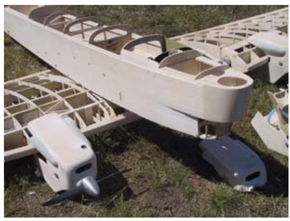
The TB-3 mother ship is conventional balsa/ply construction and will be covered with Solartex.

Ken hopes to have it ready to fly at the Keilor Display Day on April 17th.