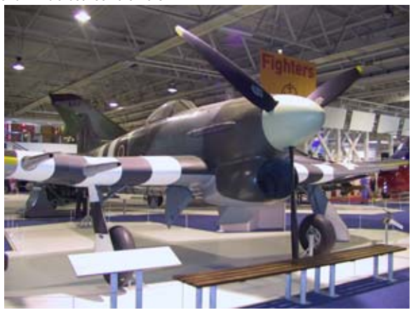
The Hawker Typhoon was designed as a high altitude interceptor but excelled as a ground attack aircraft with rockets and cannon.