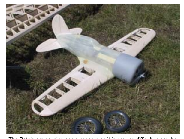
The Rata's are causing some concern as it is proving difficult to get the weight down for a reasonable wing loading. Fuselage and cowl is fibreglass. Wheels at the bottom of the picture are for the TB-3.